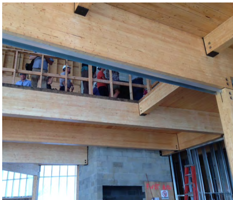
Kern Center upper structure: Nordic LAM “Glulam” timber, installed by Bensonwood of NH.

Excerpted from International Living Future Institute’s Living Building Challenge SM 14 | 3.0 living-future.org/lbc