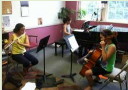
Young musicians' practice session