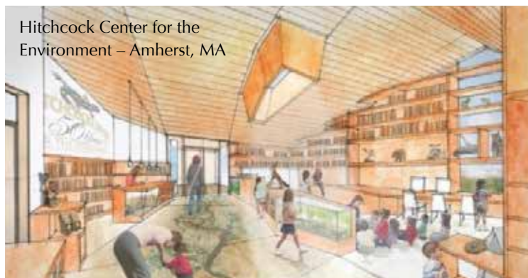
Hitchcock Center for the Environment – Amherst, MA