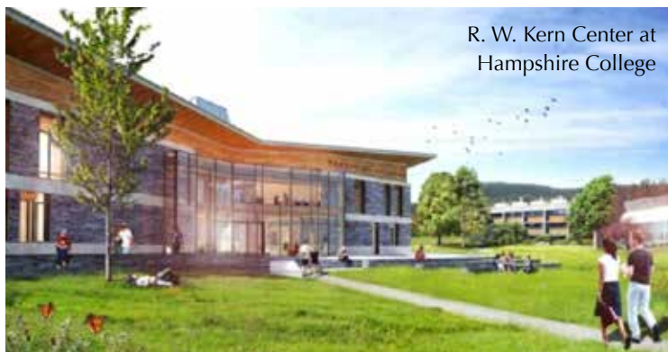
R. W. Kern Center at Hampshire College